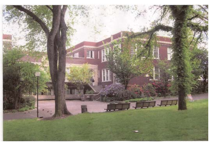
EXISTING SHATTUCK HALL