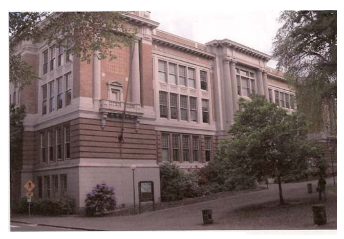
EXISTING LINCOLN HALL