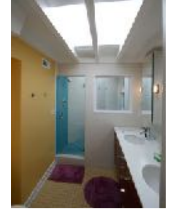
Master bath vanity