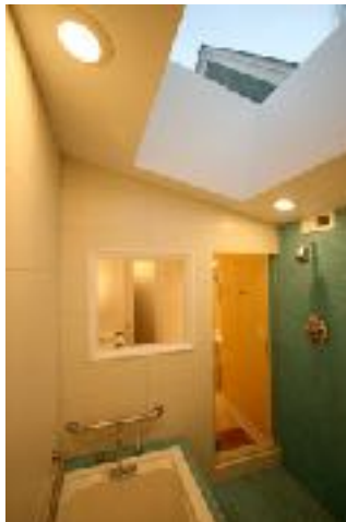
Master bat/shower room