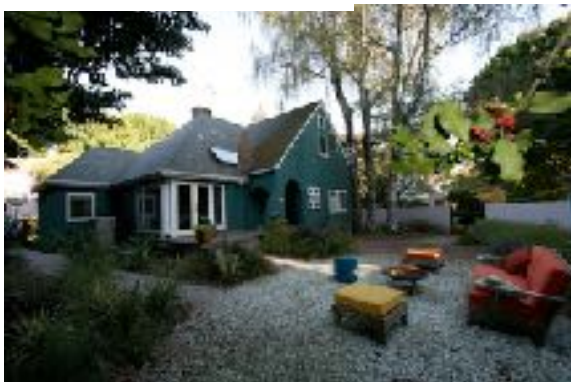
Enclosed front yard