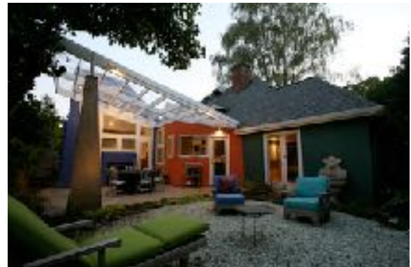
Backyard addition and patio